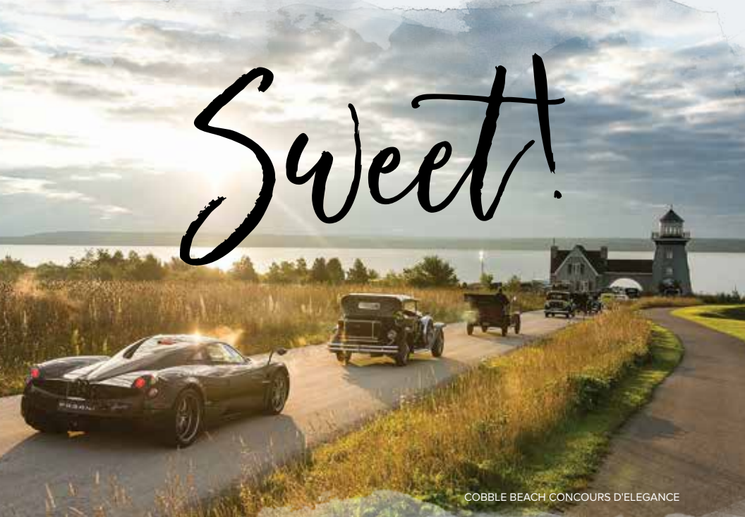
COBBLE BEACH CONCOURS D'ELEGANCE