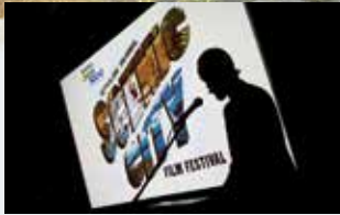
SCENIC CITY FILM FESTIVAL